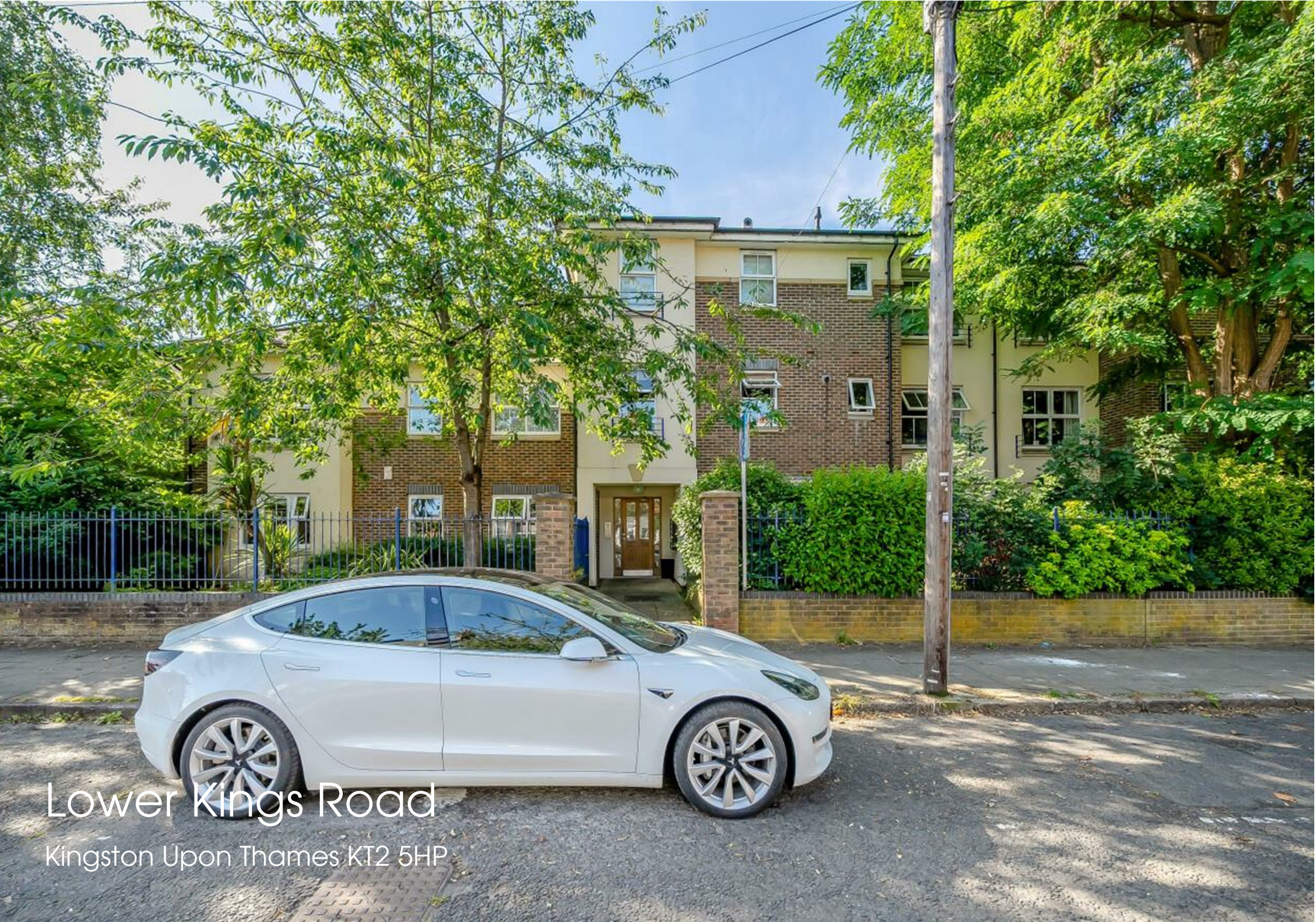
Lower Kings Road Kingston Upon Thames KT2 5HP